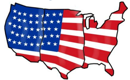
The Flag of America

There is one star for Minnesota on the U.S. flag.